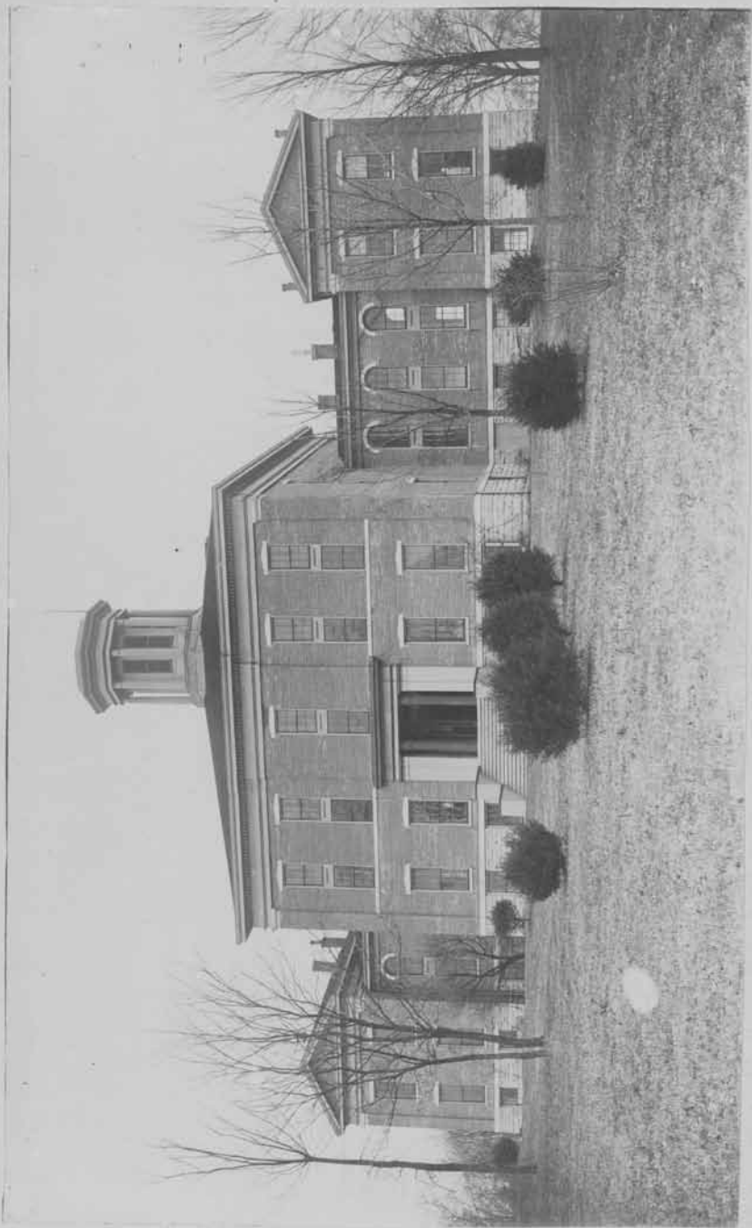
Image of Old Classic Hall (1857-1941), photograph and date unknown.